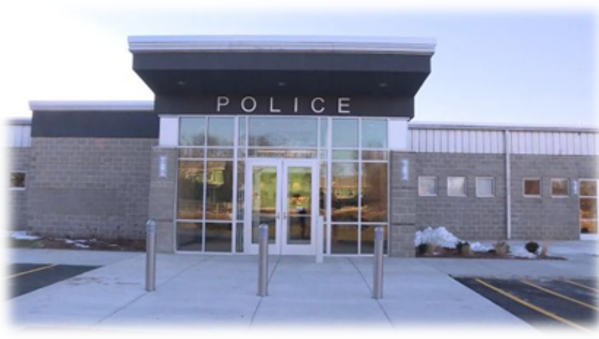
District 3 - Headquarters 557 S New Towne Drive