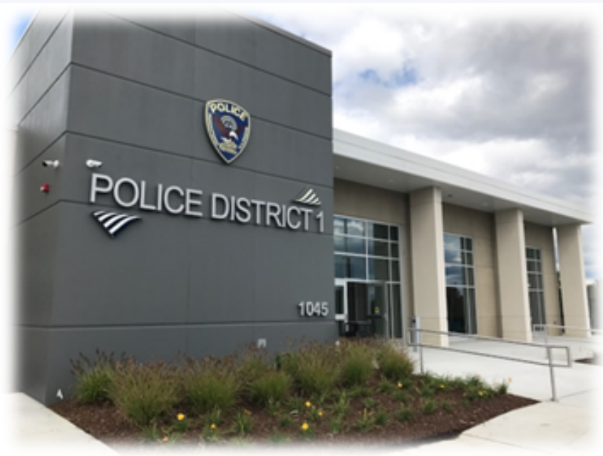
District 1 1045 W State Street