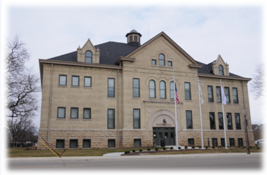
District 2 1410 Broadway